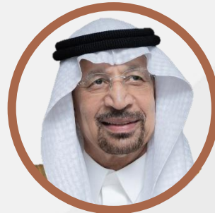
Khalid bin Abdulaziz Al-Falih

Minister of Industry and Trade of the Russian Federation