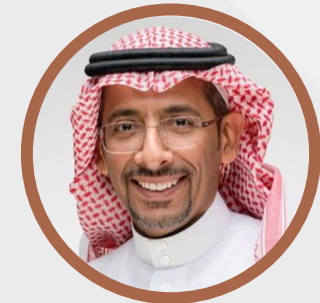
Bandar bin Ibrahim Al-Khorayef

Minister of Investment of the Kingdom of Saudi Arabia